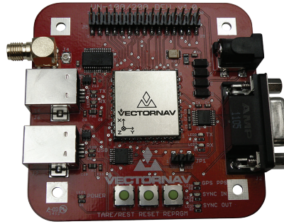
VN-100 Development Board